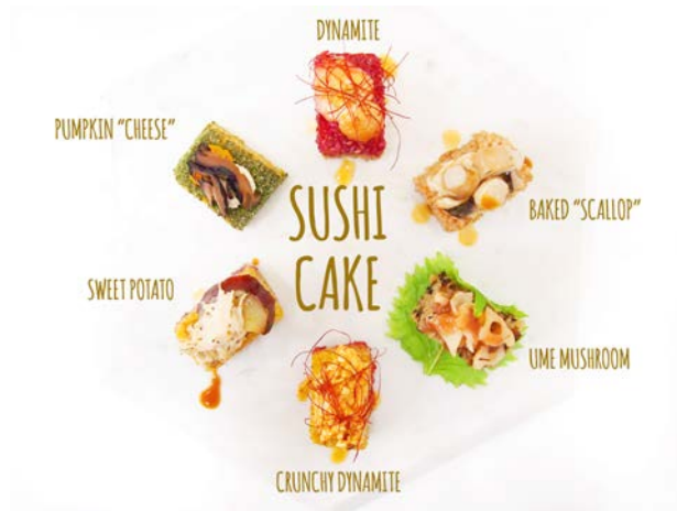
SUSHI CAKE 4/piece

All items are available a la carte by the 1/2 pint - 5